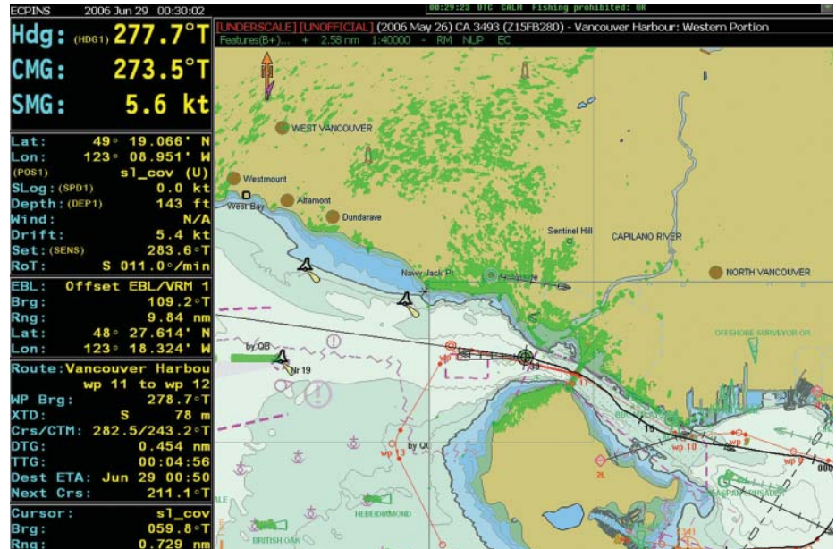
RADAR IMAGE OVERLAY